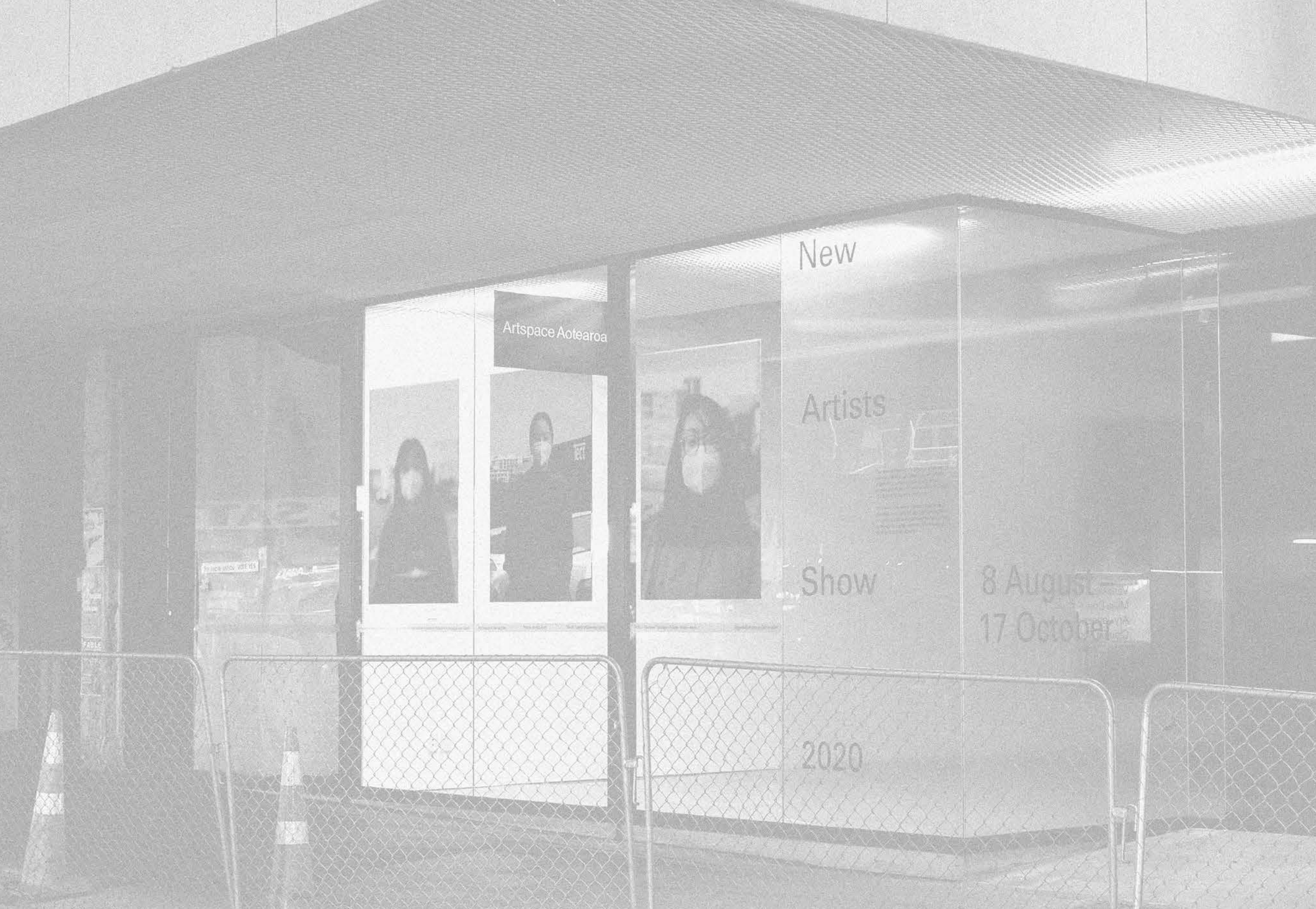
The New Artspace Aotearoa Entrance on Karangahape Road